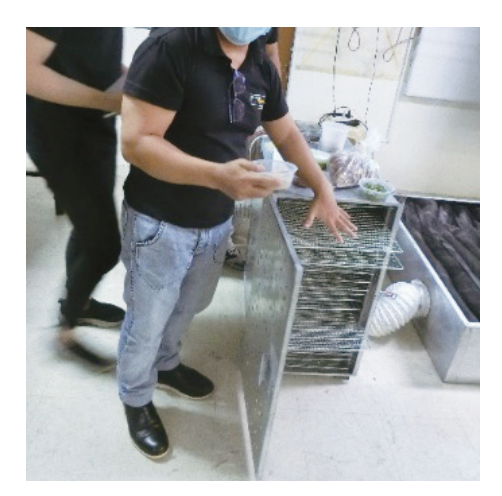
Figure 6 Research on food issues

In August 2022, we visited Wesleyan University Philippines and Bulacan State University in Cabanatuan City. The students were told that the university is working on STEM education in relation to the SDGs. Specifically, they were conducting research on dried food using the experimental apparatus shown in Figure 6 to examine food issues. Using the experimental apparatus shown in Figure 7, they were studying energy issues by conducting research on using tidal currents to create a power generator.