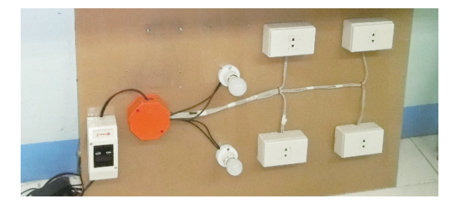
Figure 9 Handmade teaching materials

In the Philippines, science is formally taught from Grade 3 until Grade 10. In addition, specialization in science is offered for students under the STEM track. English is used as a medium of instruction for all levels. The science curriculum recognizes the important role of science and technology in everyday